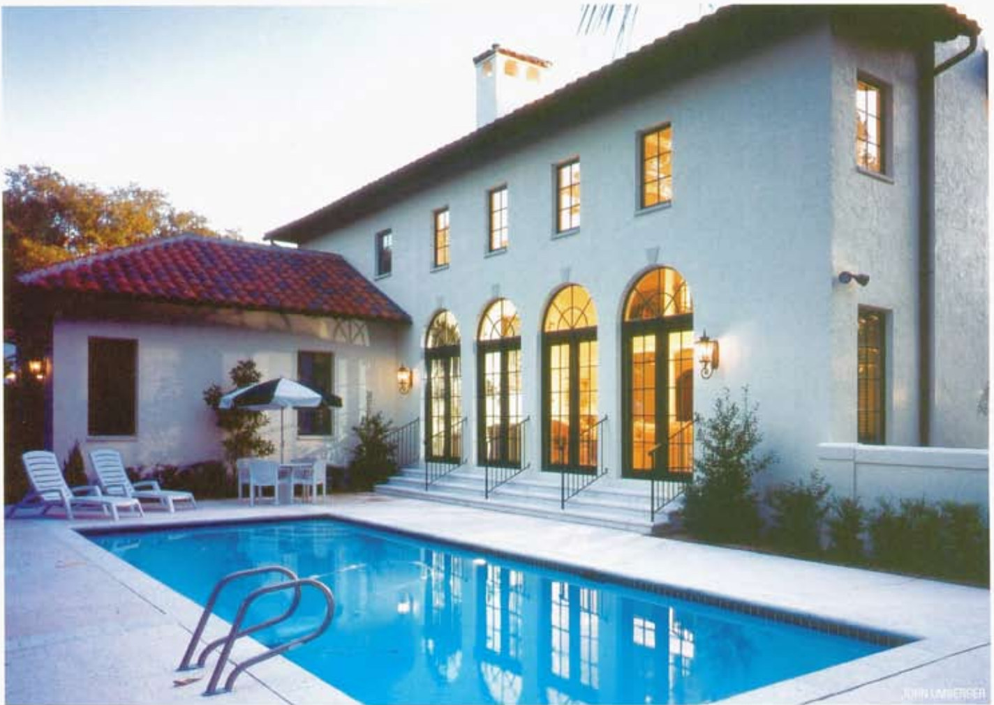
Access to pool areas and other outdoor amenities are particularly important in beach homes, since recreation and relaxation are their primary purposes.

Flexibility is also required in the overall design of the home, since almost every project has to be raised to some extent per FEMA guidelines, either on an elevated foundation or on pilings. Ideally, you don't want the home to look like it's just floating there, which can be a challenge if your front door is 10' in the air. To soften that look, we'll break up the steps with design elements. You may walk up two stairs to an elevated sitting area, then up several more to a water feature on a landing before you reach the front door.